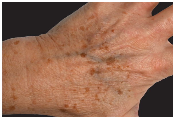
1 MONTH AFTER THE LAST TREATMENT